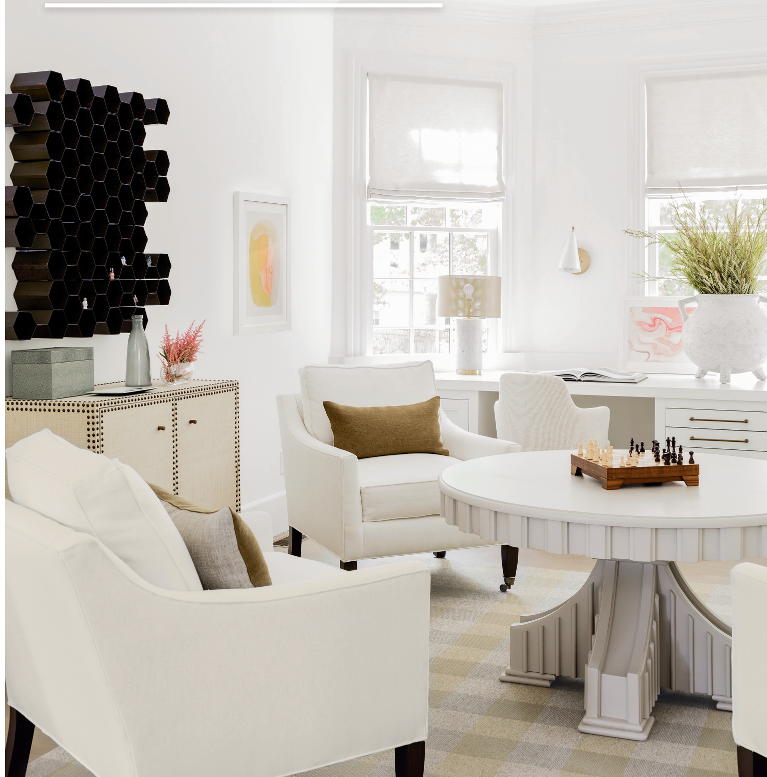
TABLE , English Farmhouse Furniture.

In addition to homework and crafts, the children's study is also intended for family games and Lego projects, so plush armchairs pull up to a large round table that seats the whole family. Old wine racks were installed as clever wall art.