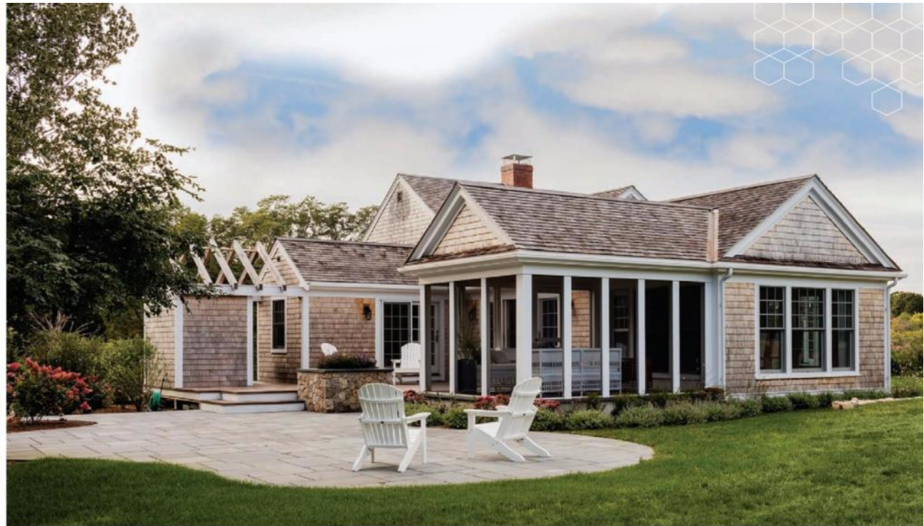
CLOCKWISE FROM ABOVE: The master bath's indoor shower connects to its outdoor counterpart. A view of the new ell that maximizes indoor and outdoor space at the back of the house. A second outdoor shower has an open rafter roof and walkway to kitchen deck. One of two matching vanities in the master bath; the wire bases are former flower displays.