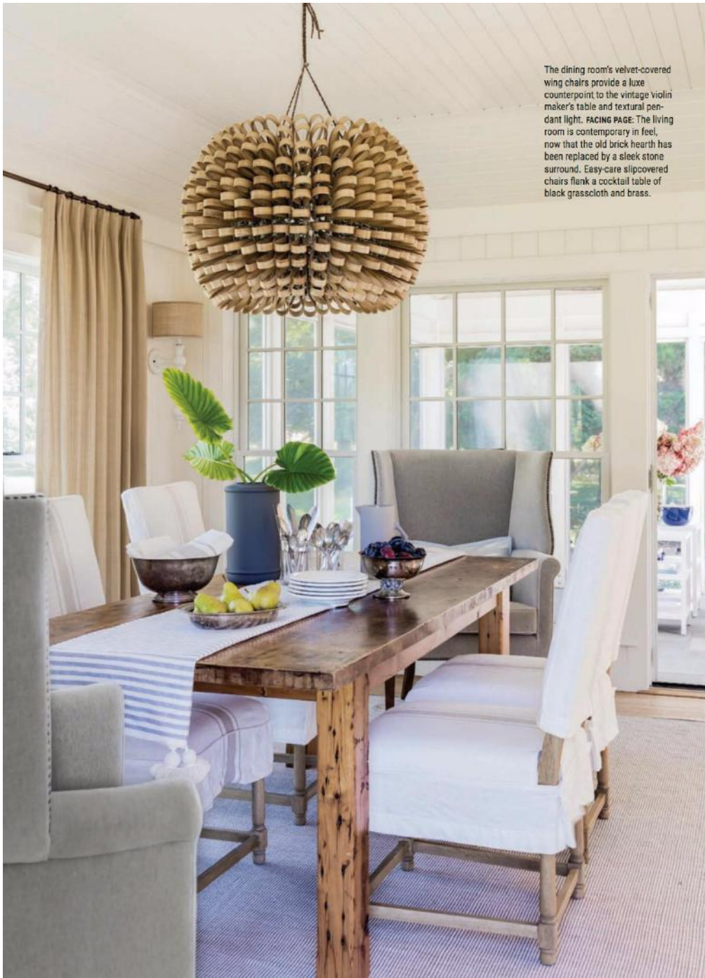
The dining room's velvet-covered wing chairs provide a luxe counterpoint to the vintage violin maker's table and textural pendant light. FACING PAGE: The living room is contemporary in feel, now that the old brick hearth has been replaced by a sleek stone surround. Easy-care slipcovered chairs flank a cocktail table of black grasscloth and brass.